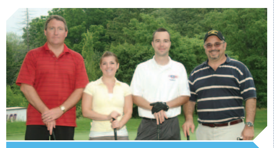
Rite Aid Team