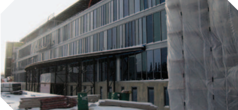
(Above) Kapoor Hall Southside. (Below) Kapoor Hall Northside